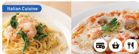
10F Restaurant Area

Enjoy items such as boiled tofu made from Saga soybeans and Niigata rice made fresh as soon as you order it.