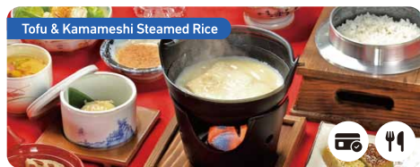
10F Restaurant Area

With each bite, the fresh fragrance of buckwheat noodles envelops your palate, while their savory umami unfolds in your mouth. The restaurant is a spinoff of the long-established "Kanda Yabusoba" soba restaurant which typifies Tokyo.