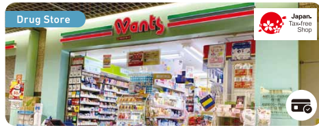
Shareo North Street

We offer jewelry that enhances your individuality for those who appreciate style not only in special occasions but in everyday moments. Stay fashion-forward as you age with our trend-sensitive pieces.