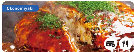
10F Restaurant Area

The restaurant buys a whole Yamagata marbled beef which features a fine texture. Enjoy rare cuts of beef to your heart's content.