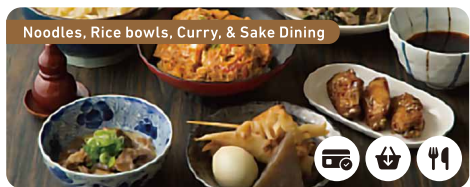
Hiroshima Bus Center 3F "Bus Machi Food Hall"

A specialty coffee shop offering authentic, house-roasted specialty coffee.