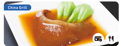
10F Restaurant Area

Enjoy a relaxing time with freshly baked fruit pie and carefully brewed tea.