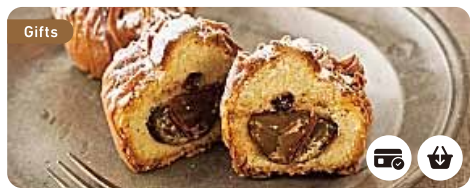
Hiroshima Bus Center 3F "Bus Machi Food Hall"

Indulge in specialty juices and salads crafted with care by vegetable specialists (farmers).