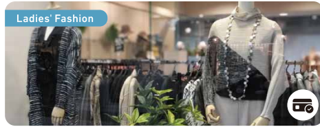
Shareo West Street

Staying beautiful at any age. Staying true to myself each day, filled with vibrant colors.