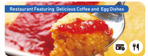
10F Restaurant Area

Enjoy genuine Chinese cuisine prepared with high-quality ingredients. Shaoxing rice wine and a wide variety of other Chinese spirits are also available.