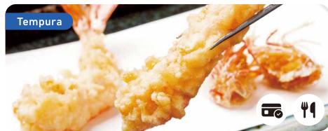
10F Restaurant Area

The Origin of Hiroshima-style okonomiyaki savory pancakes. Savor Setouchi ingredients cooked on a teppanyaki iron grill amid a stylish ambiance.