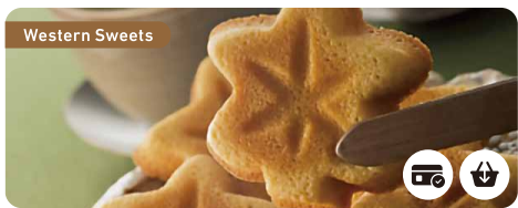
Hiroshima Bus Center 3F "Bus Machi Food Hall"

Discover popular souvenirs, local sake, food items, and more in Hiroshima.