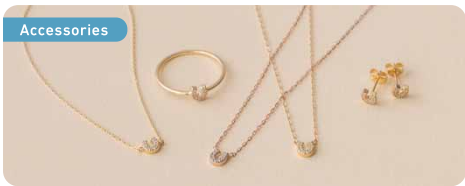
Shareo South Street

Staying beautiful at any age. Staying true to myself each day, filled with vibrant colors.