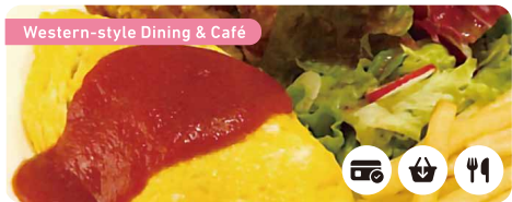
AQ'A Hiroshima Center City 7F

Enjoy a variety of pasta in a casual setting with our diverse menu.