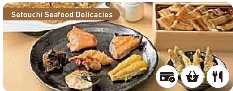
Hiroshima Bus Center 3F "Bus Machi Food Hall"

A local bakery where you can enjoy freshly baked delicious bread.