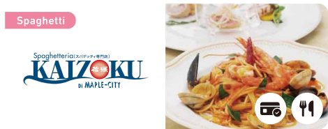
AQ'A Hiroshima Center City 7F

A specialty café known for its premium coffee and freshly baked French toast.