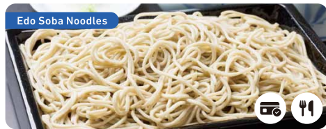
10F Restaurant Area

We proudly serve crispy tempura using our exclusive premium sesame oil, gaining recognition both domestically and internationally.