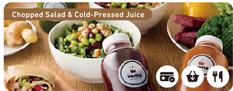
Hiroshima Bus Center 3F "Bus Machi Food Hall"

Savor the freshness of seasonal ingredients, including freshly sourced seafood and vegetables from the market.