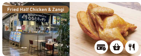
Hiroshima Bus Center 3F "Bus Machi Food Hall"