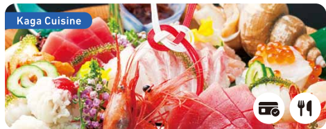
10F Restaurant Area