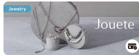
Shareo East Street

Our concept is: "a shop with a hat for every member of the family." We offer a lineup of over 1,000 hats. We also have a variety of NEWERA, 47, and our original items available.