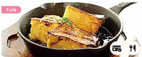
AQ'A Hiroshima Center City 4F