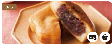
Hiroshima Bus Center 3F "Bus Machi Food Hall"

A specialty store featuring maple sweets made with maple syrup from Quebec, Canada.