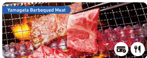
10F Restaurant Area

Thoroughly enjoy the highest level of hospitality in Hiroshima at "Kagaya," a branch of the long-established, luxury Japanese-style inn in Noto Peninsula and Wakura Hot Springs.