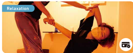
Shareo West Street

Saishiki Chopsticks 1,320 yen, Saishiki Chopstick Rest 550 yen Black Rice Pot (3 cups) 5,500 yen