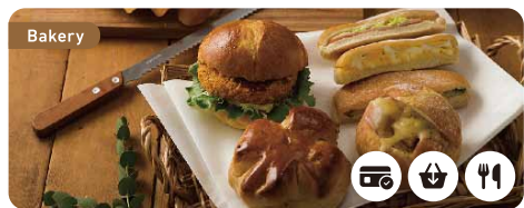
Hiroshima Bus Center 3F "Bus Machi Food Hall"

Savor retro-style Chinese noodles, udon noodles, rice bowls, and popular curry at our establishment.