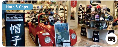
Shareo West Street

Thai massage Chai/Relaxation/Thai massage 60min 5,170 yen