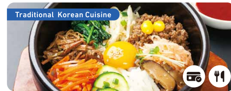
10F Restaurant Area

A chic restaurant with chansons playing in the background. It offers seasonal ingredients and wild-fish prepared and cooked French style.