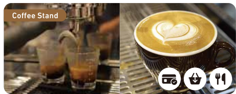
Hiroshima Bus Center 3F "Bus Machi Food Hall"

A dining cafe where you can enjoy meals and casual drinks anytime, all day long.