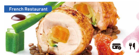
10F Restaurant Area

We offer Italian cuisine featuring fresh Hiroshima ingredients, including a buffet of appetizers with fresh vegetables, seafood from the Seto Inland Sea and delicacies from the mountains.